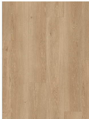
SEA BREEZE OAK NATURAL