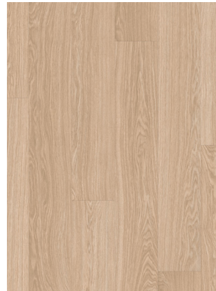
PURE OAK BLUSH