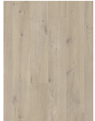
COTTON OAK BEIGE