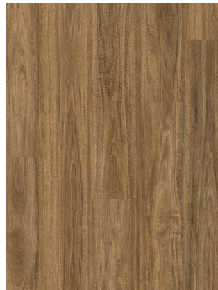
WILD SPOTTED GUM