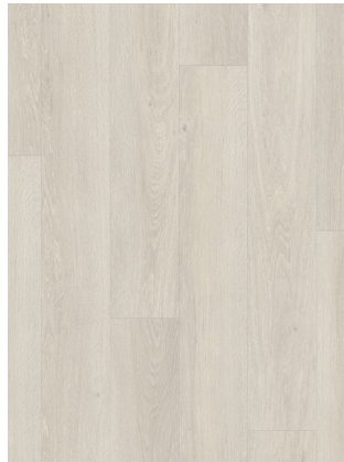
SEA BREEZE OAK LIGHT