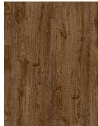
AUTUMN OAK BROWN