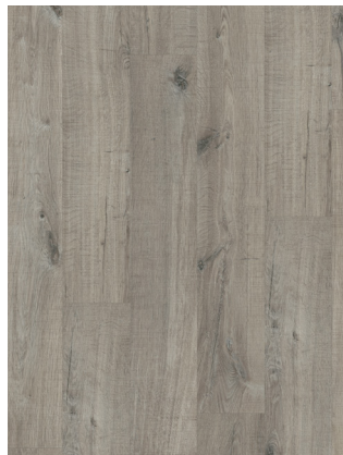
COTTON OAK GREY WITH SAW CUTS