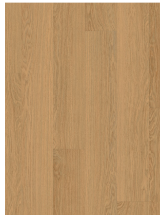
PURE OAK HONEY